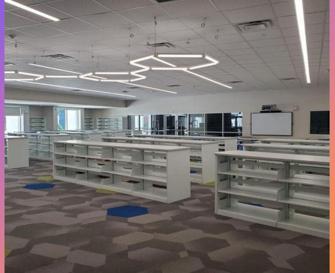
Media with Library Reading Rooms, Periodicals, Stacks and Extended Learning Area