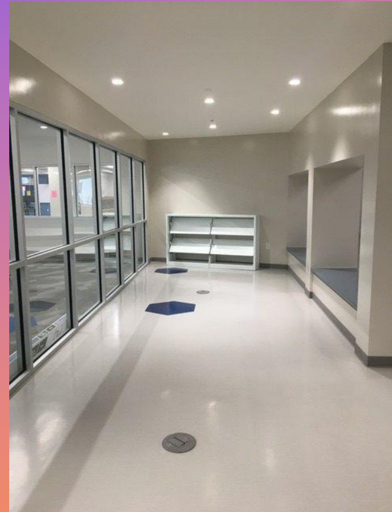
Media Specialist Station, Periodicals, Reading Breakout Areas, Interior Circulation