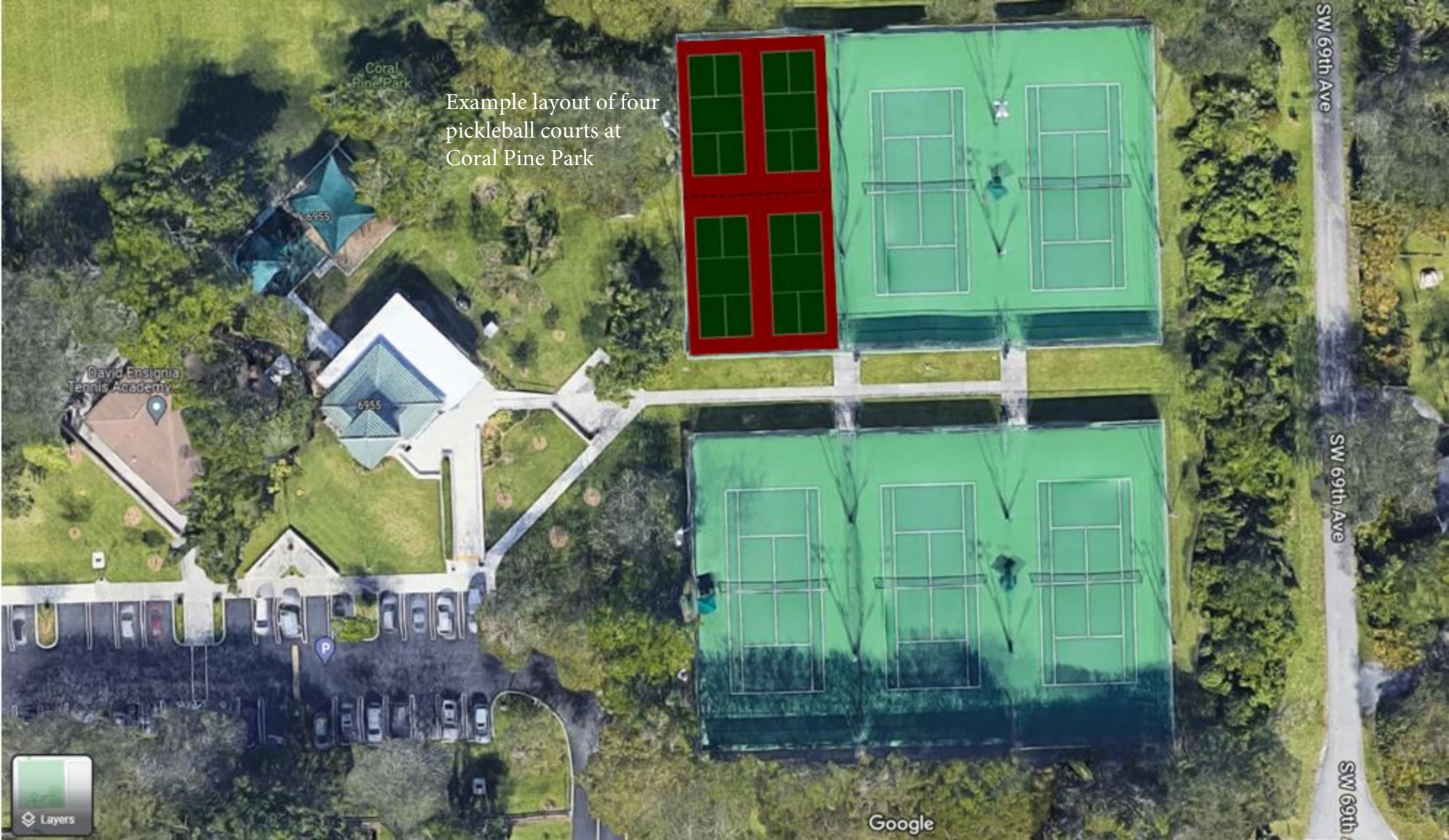
Example layout of four pickleball courts at Coral Pine Park