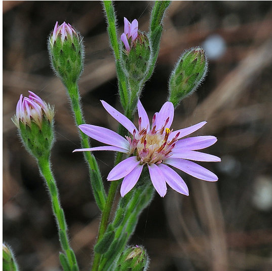
Photo by Roger Hammer. Photograph belongs to the photographer who allows use for FNPS purposes only. Please contact the photographer for all other uses.